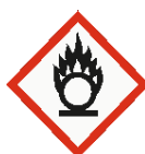
Flame over circle